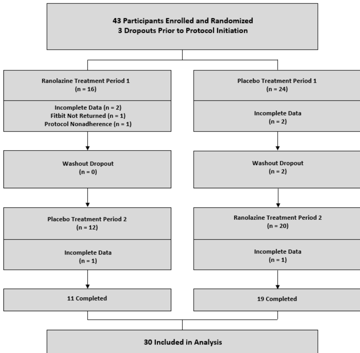
Figure 2. Substudy participant screening, enrollment, randomization, and completion flow diagram. Participants were randomized to sequence of ranolazine first followed by crossover to placebo (treatment period 1) or vice versa (treatment period 2). For both treatment periods 1 and 2, daily activity monitoring occurred during week 2.